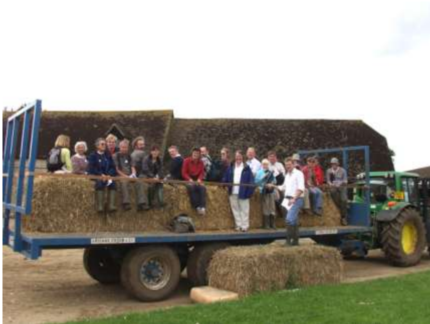
Figure 2: The Farm Animal Initiatives tractor about to take the workshop to Somerford Mead, Wytham near Oxford

Our visit to see the Somerford Mead plots was facilitated by a tractor ride laid on by Farm Animal Initiatives (Figure 2), who manage the land as part of their interest in animal-friendly farming. The seed source for the Somerford plots was Yarnton Mead, part of the Oxford Meadows SAC, on the other side of the Thames, so we then visited this site, where marker stones still show the strips of land where the hay associated with each lot ball should be taken.