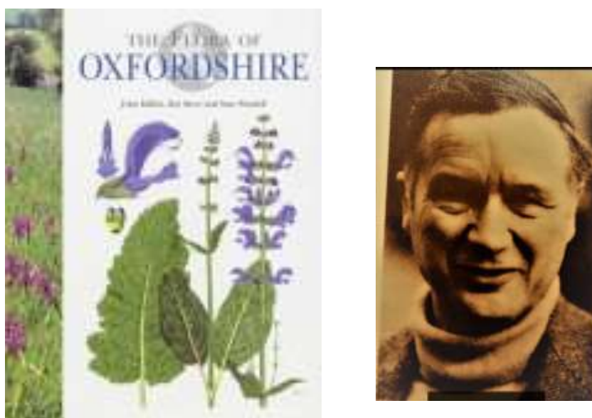
Figure 3. The Flora of Oxfordshire published in 1998