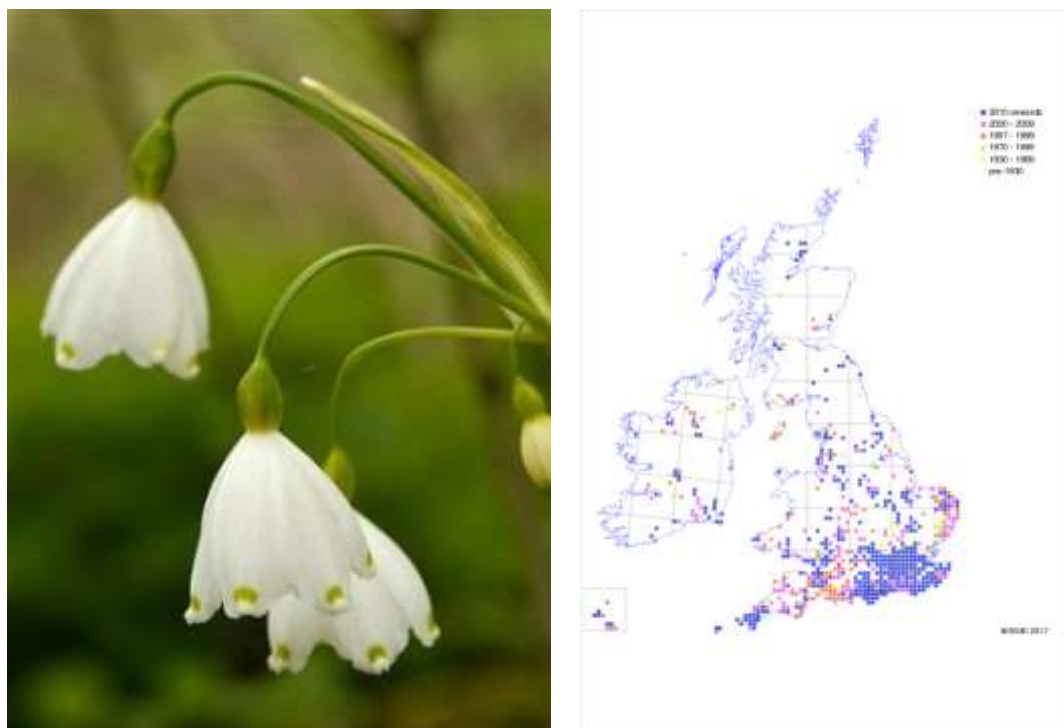
Figure 2. Leucojum aestivum , Summer Snowflake, and its distribution map

The job was then not onerous then and didn't, and still doesn't, imply the writing of a County Flora. It was to receive and keep records from botanists (often on pink cards; many good ones from Humphry Bowen), the Biological Records Centre and elsewhere; many of the latter related to rarities or threatened species, notably Summer Snowflake, Leucojum aestivum .