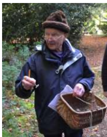
Figure 4. Enjoying a Field outing with the Abingdon Naturalists in 2008 and leading a Fungus Foray in 2017